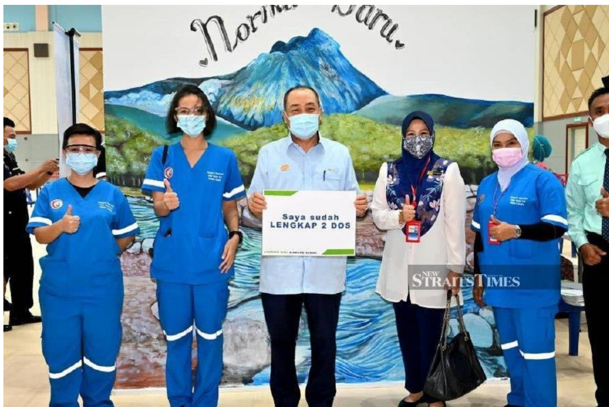
Sabah Chief Minister Datuk Seri Hajji Noor (centre) after receiving the second dose of Pfizer-BioNTech Covid-19 vaccine at the Federal Government Administrative Complex.

Bernard also said the handing over of the land for federal agencies use is in line with Article 83 of the Federal Constitution.