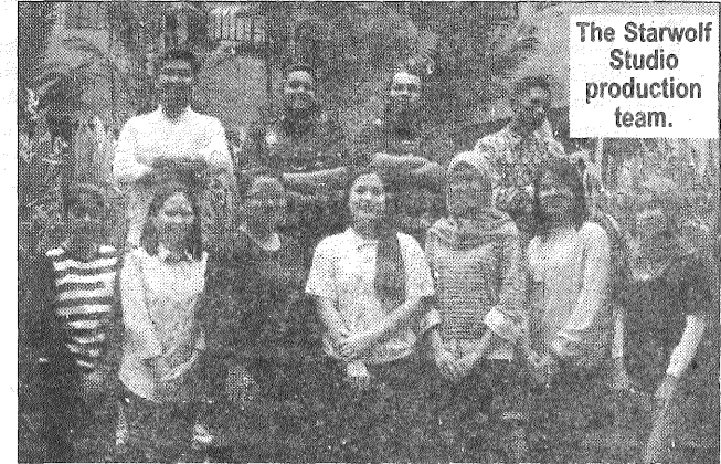
The Starwolf Studio production team.

THIRD YEAR STUDENTS undertaking Bachelor’s in Creative Arts (Writing Major) in University Malaysia Sabah (UMS) produced a short film titled “Nikambalu”.