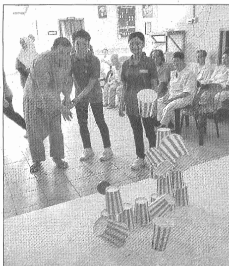
UMS nurses goes all out, bringing joy for a long-stay residents at Hospital Mesra in Bukit Padang.