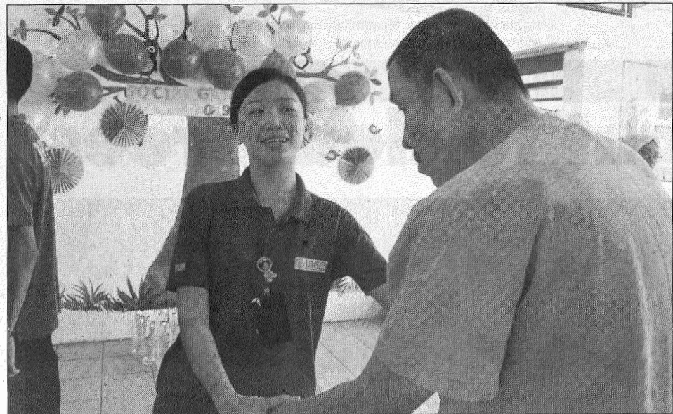
A UMS student nurse interacting with one of the psychiatric residents at Hospital Mesra in Bukit Padang.