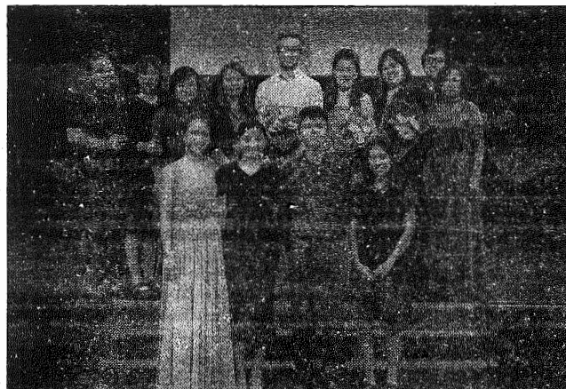
The performers at the event.

Joseph Canteloube's Chants d'auvergne, and appeared as the soprano soloist in Handel's Ode for St. Cecilia's Day, Handel's Messiah, and Beethoven's Symphony No. 9.