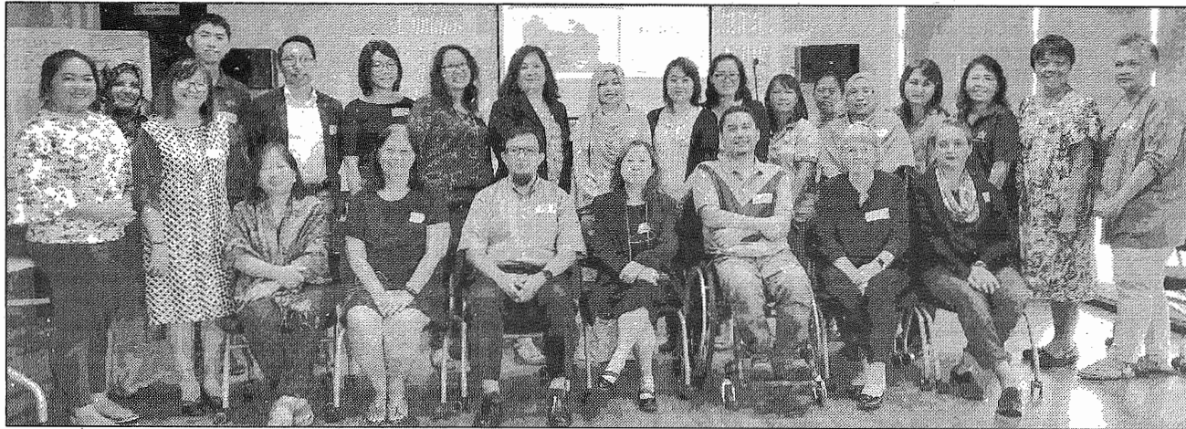
Participants of a dialogue between the UMS-UNICEF Communication for Development (C4D) Research Unit and civil society organisations at the Sabah State Library in Tanjung Aru.