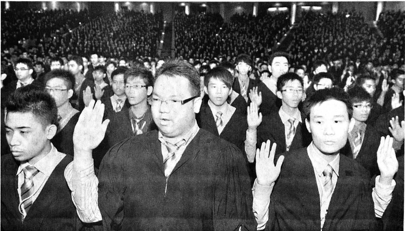
UMS students taking their oath at the Aku Berjani ceremony.