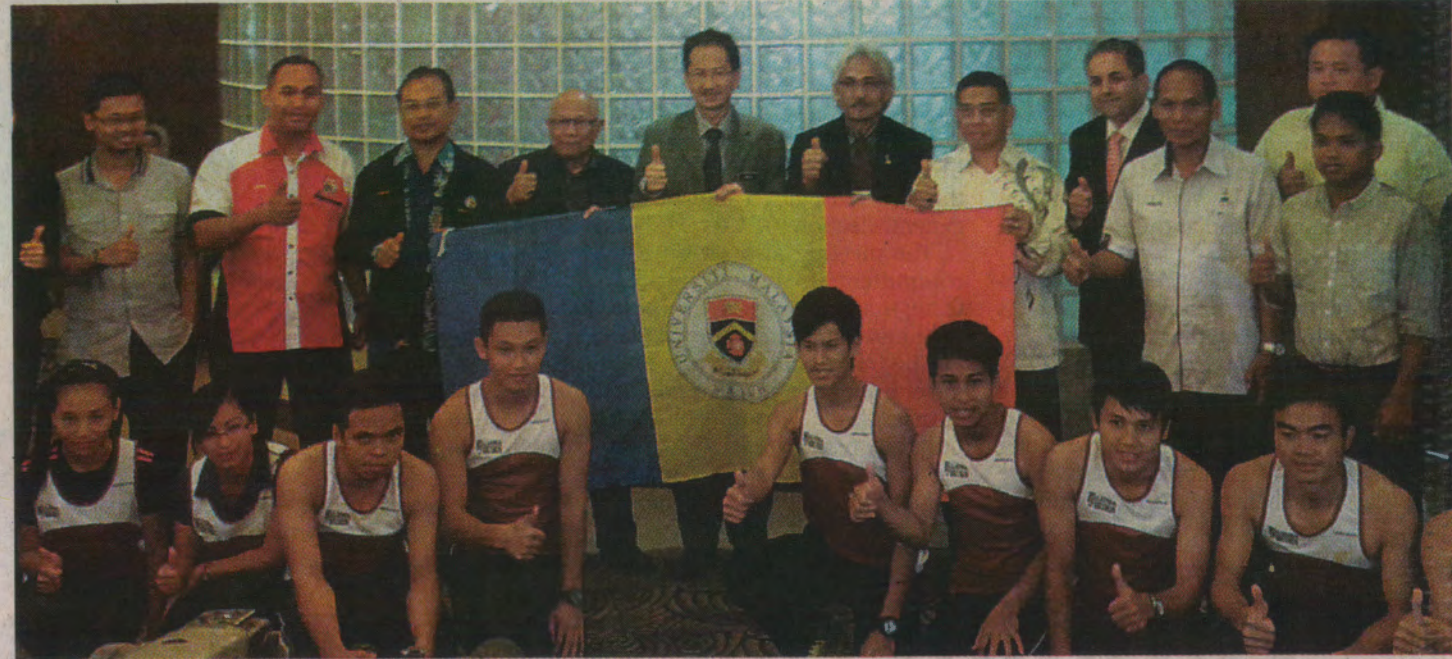
The nine athletes in a group photo with the sponsors and vice chancellor.