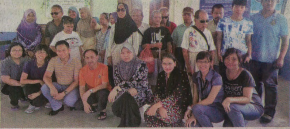
UMS students visiting the Sabah Society For The Blind recently.