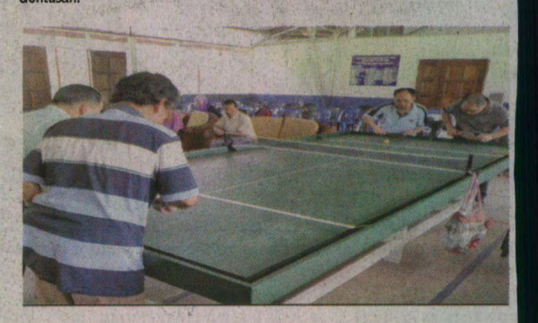
The communities enjoy their time by playing table tennis with their friends.

It functions as a sheltered workshop to cater to the needs of the blind who have been trained in various specific fields while waiting to secure employment. It also provides temporary accommodation to deserving blind members and those in dire straits.