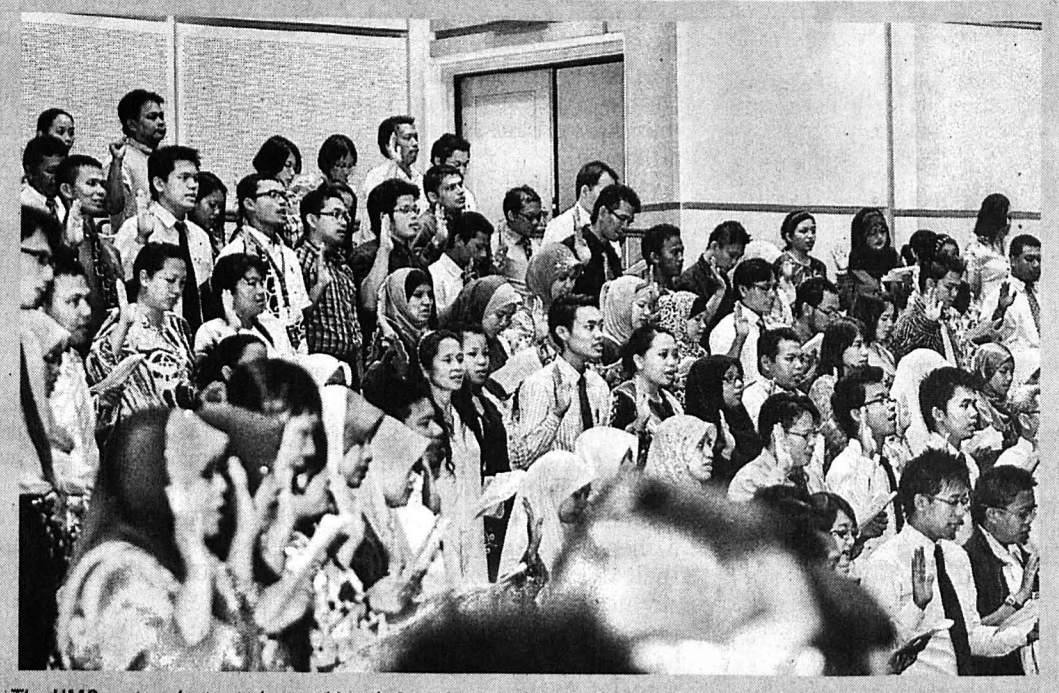
The UMS postgraduate students taking their oath yesterday.