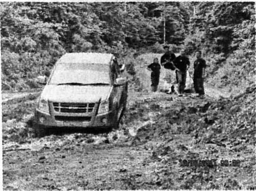
Getting a taste of off-road experience.