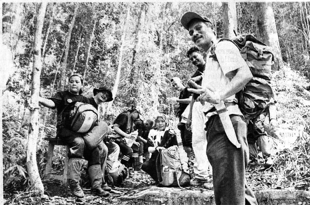
Taking a rest in Nepenthes Trail.