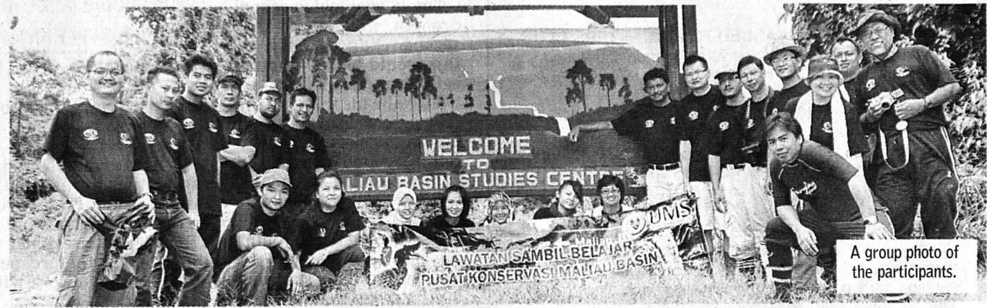
A group photo of the participants.