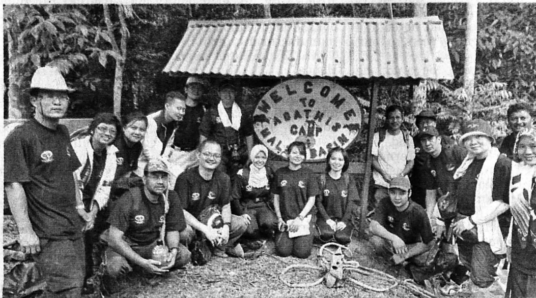
Taking a remembrance photo at Agathis Camp.