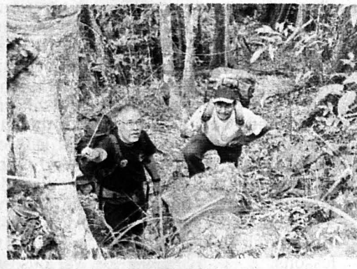
Jungle trekking on the way to Camel Trophy Camp.