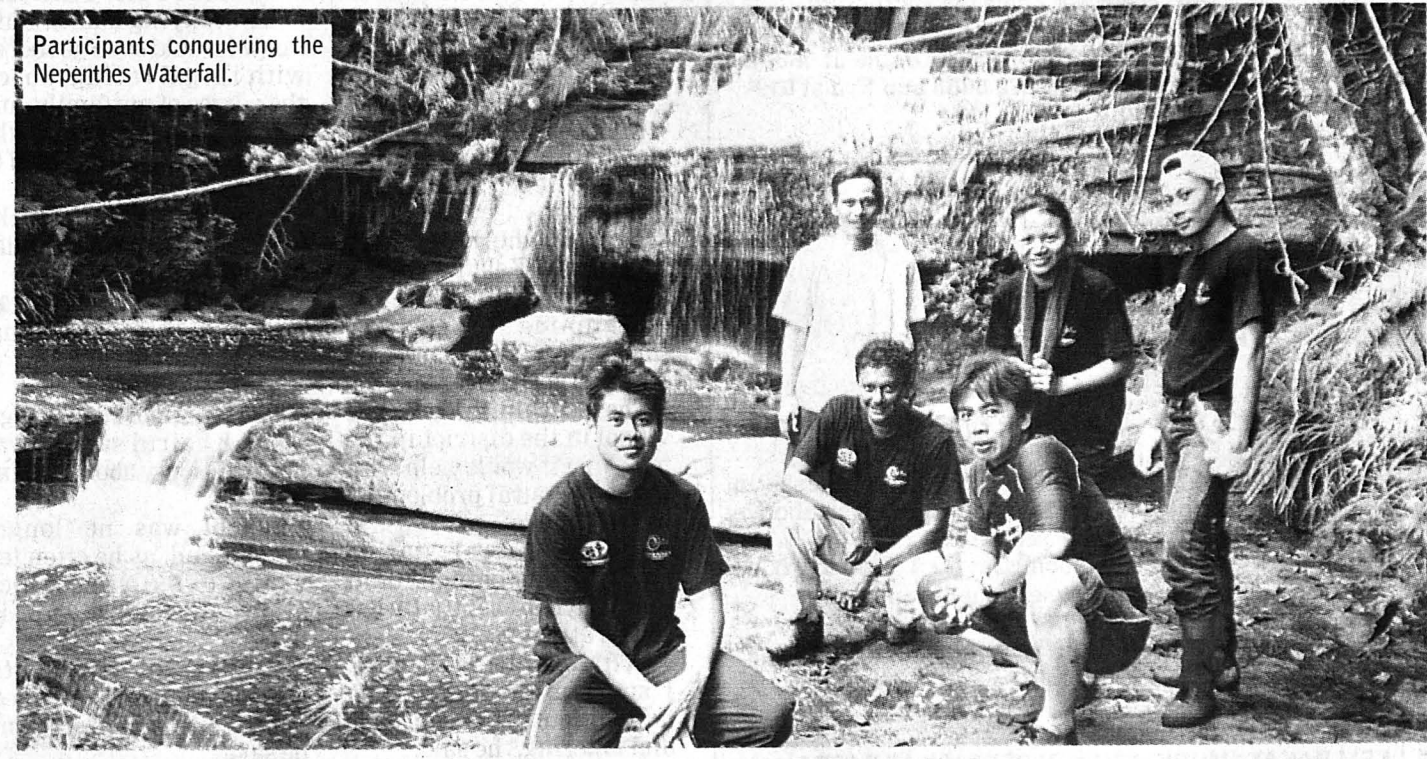
Participants conquering the Nepenthes Waterfall.