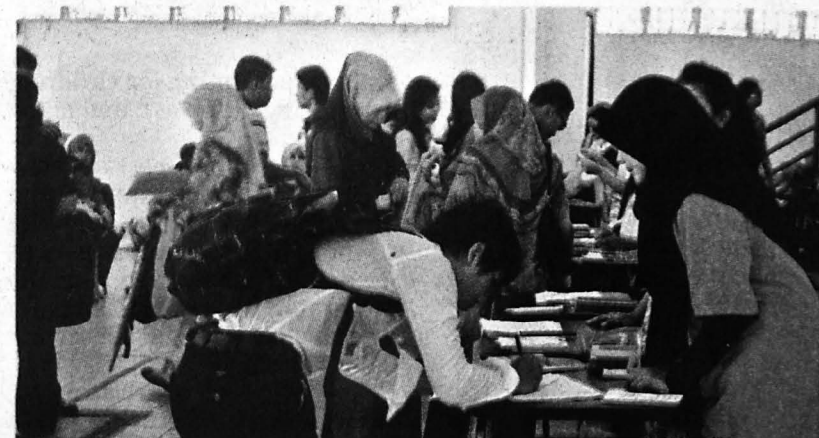
New students enrolling at Universiti Malaysia Sabah yesterday.