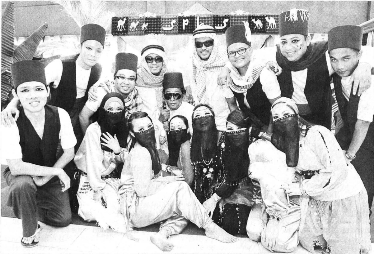
The winners of the stalls competition, the SPKS, with their Arabian concept stall.