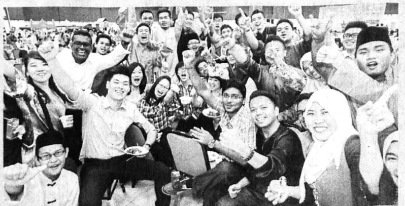
UMS students taking the opportunity to taste the food and beverages prepared by their fellow students.