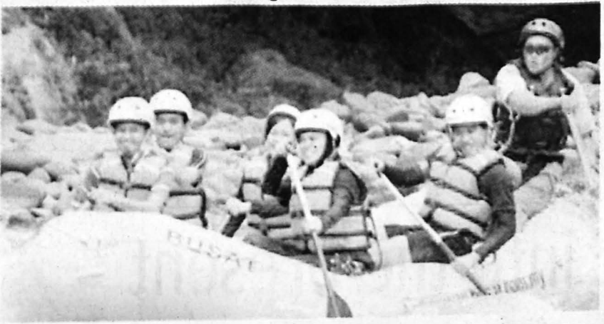
The participants doing the 9km rafting along the Kiulu River.

The participants also took part in adventurous activities such as Trail Run and River Swim, Borneo Rafting and Village of Adventure and Team Endeavour, where all of them were organised in a kind of Corporate Wargame.