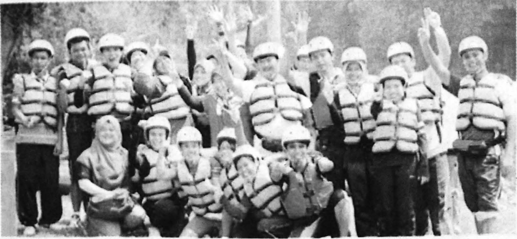
A group photo of the excited participants.