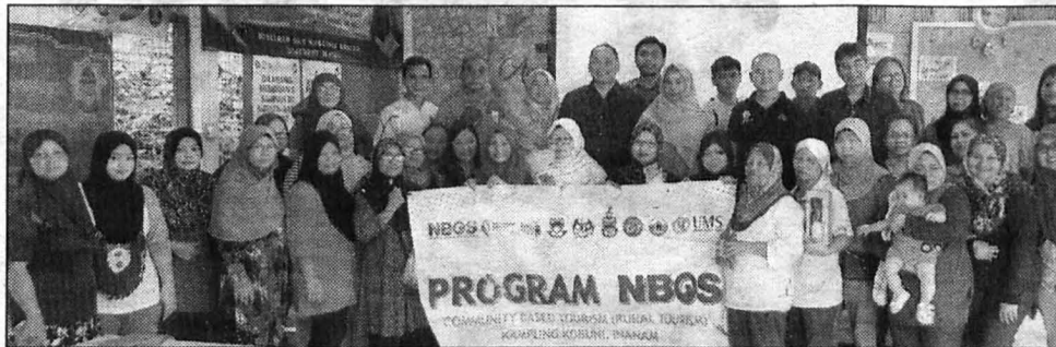
Organising committee members and participants together during the seminar.