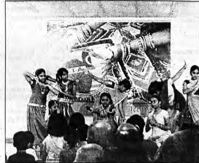
Young dancers perform the dandiya.

The SIA is one of few associations in Sabah to have its own building. It was established in 1947 during the time of the British North Borneo Chartered Company to look after the welfare and well-being of Indians in the state who had been brought from India.