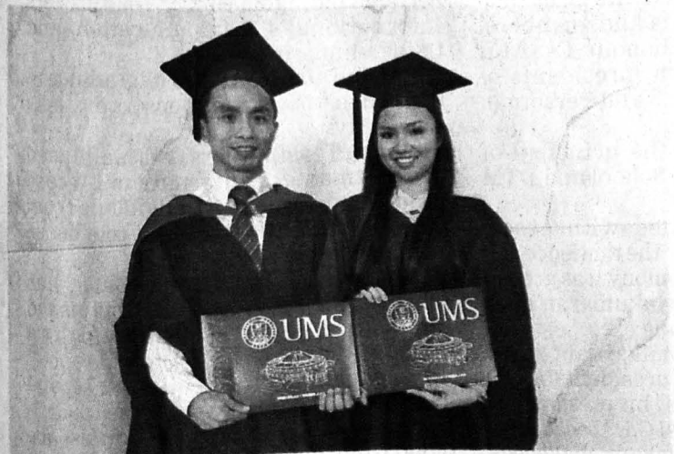
A couple received their masters on Saturday.

up business administration program which they saw UMS as a trademark for business studies while students from Tanzania would study engineering here.