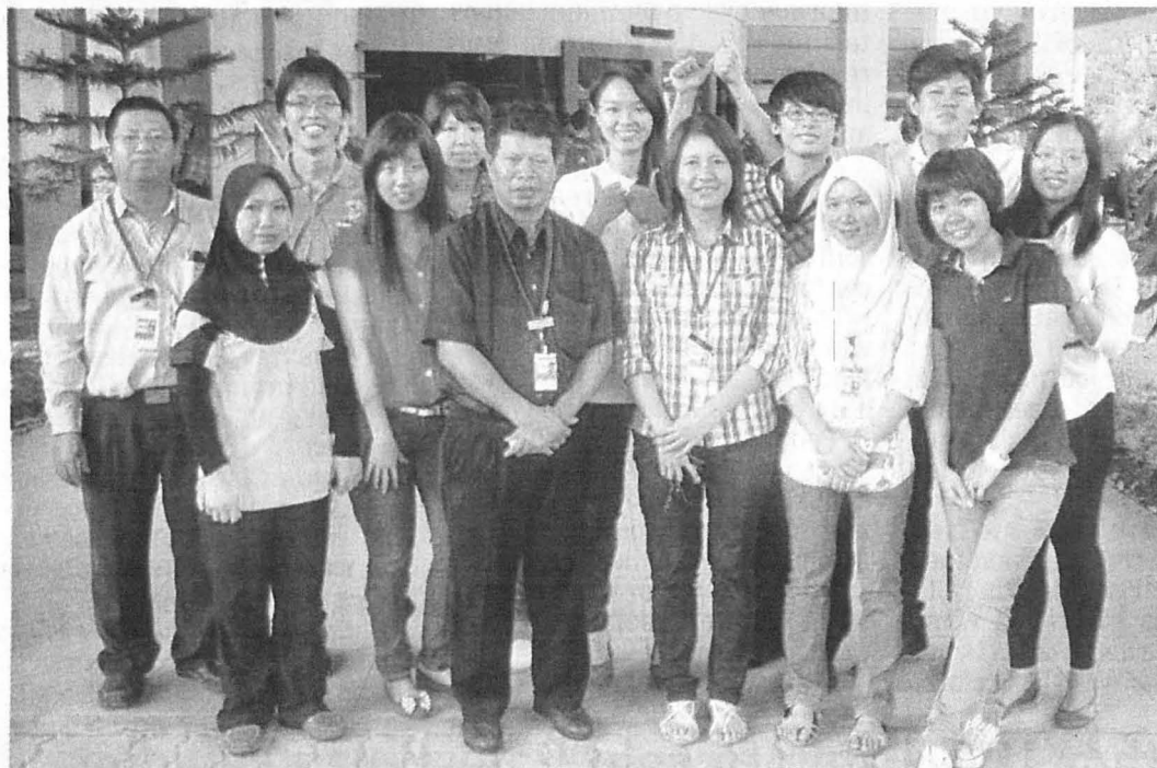
The UMS students with the hospital staff who came to help in the blood donation campaign.