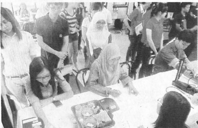
Registration of blood donors.