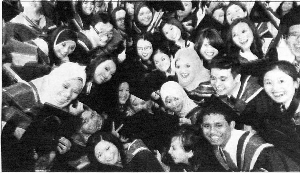
We did it...part of the graduates yesterday