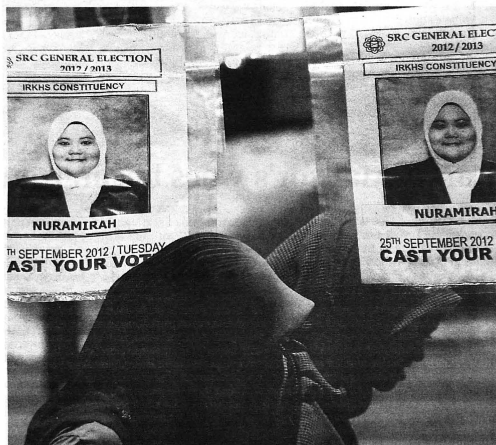
International Islamic University Malaysia students walking past campaign posters at the university campus in Gombak, Kuala Lumpur yesterday.