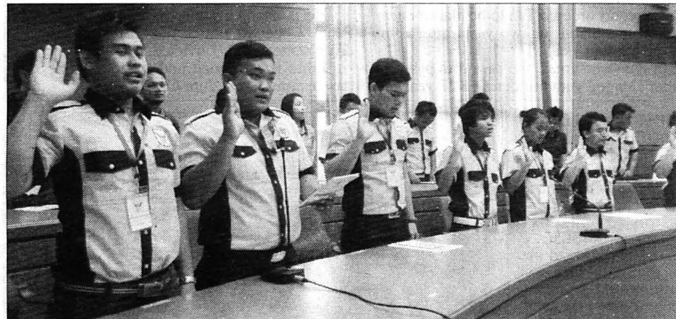
The 12 new students taking the BTEC Level 2 Certificate in Operation Technician take their oath.