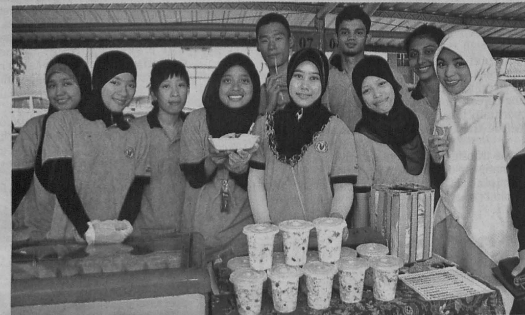
The students pose in front of their stall.