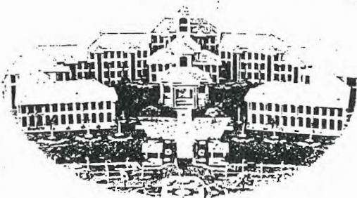
One of the Proposed School Buildings. Expected completion: 1998