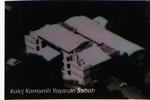
Kolej Komuniti Yayasan Sabah

UNIVERSITI MALAYSIA SABAH UMS is the acronym for Universiti Malaysia Sabah and it is the ninth national university under the Education Ministry of Malaysia. I joined this university in 1996 before a psychology department was even formed. I remember we were located at Kolej Komuniti Yayasan Sabah . This was a time when Universiti Malaysia Sabah was not even completely build yet. At that era, there were 3 branches, the Gaya Centre Administration, KKYS Campus and Jalan Tuaran Campus.