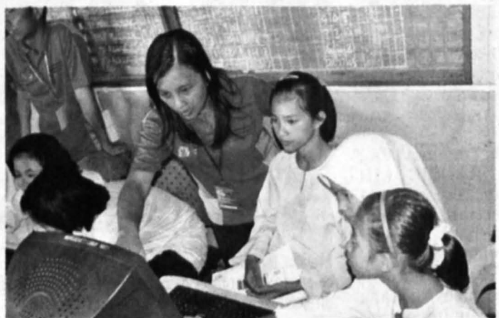
Facilitators assisting students with basic computer literacy.

The undergraduate students also trained the pupils in basic computer literacy to ensure that the donated computers