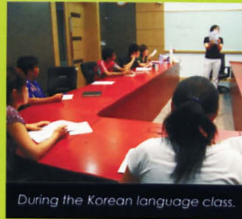
During the Korean language class.