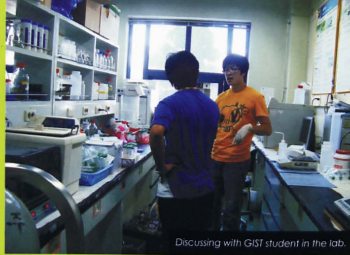
Discussing with GIST student in the lab.