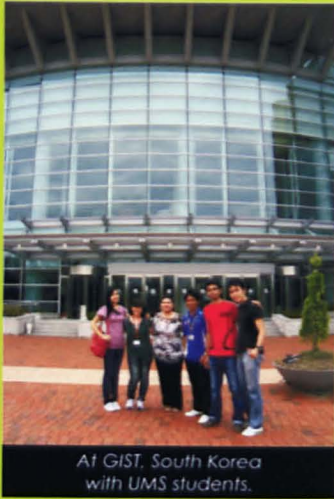
At GIST, South Korea with UMS students.

Gwangju Institute of Science and Technology is one of the well known research institution in South Korea where Universiti Malaysia Sabah has long foster research collaboration with. Several of SST's academic staffs have also been attached at GIST for research collaboration. The MoU between UMS and GIST again has given the opportunity to UMS's