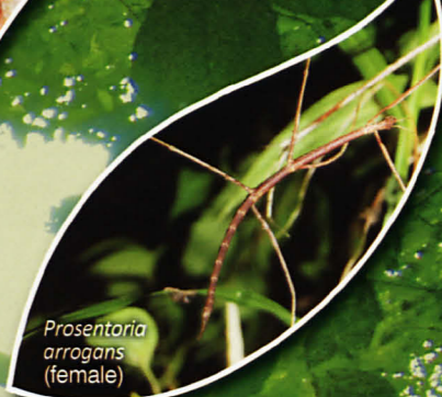
Prosteraria arrogans (female)