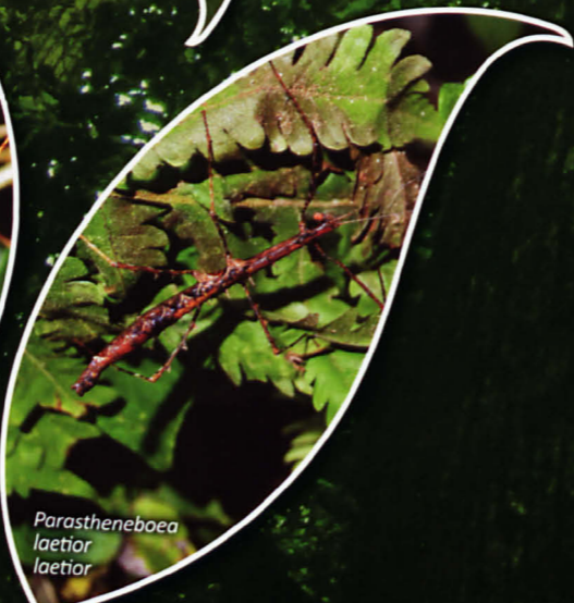
Parastheneboea laetior laetior