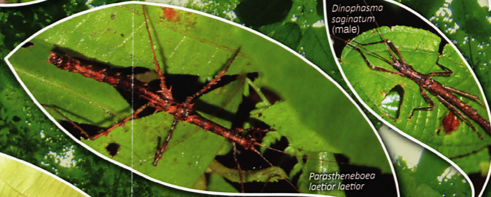
Dinophasma saginatum (male)