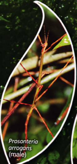
Prosteraria arrogans (male)