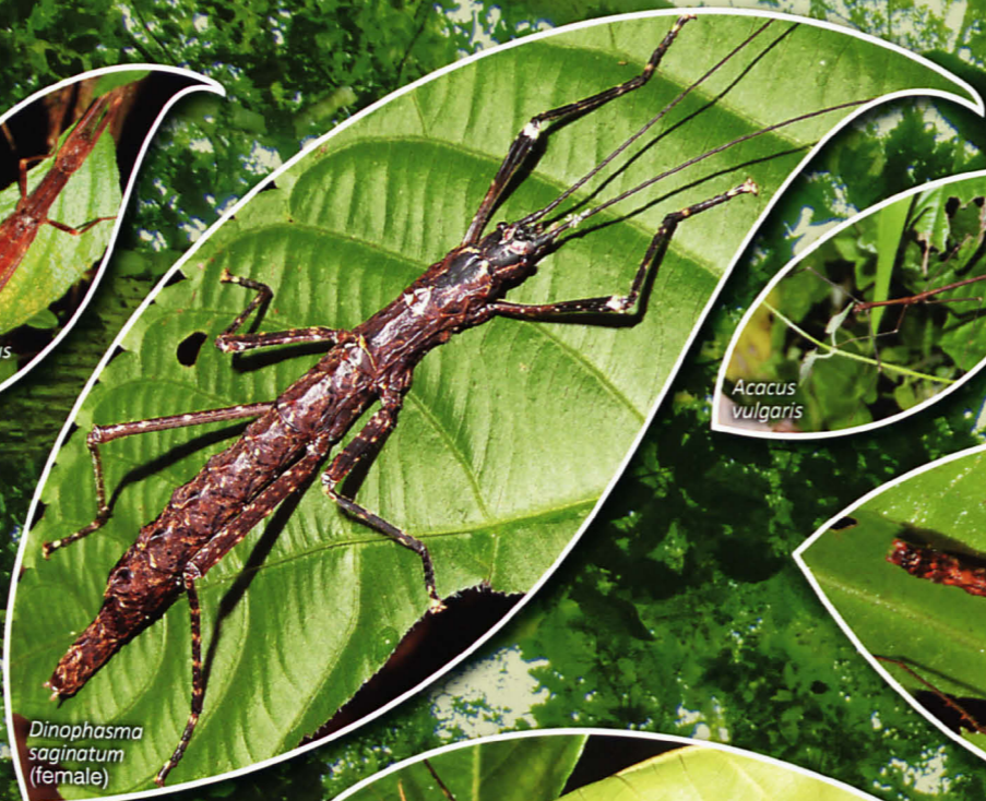
Dinophasma saginatum (female)