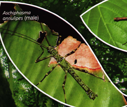
Aschiphasma annulipes (male)