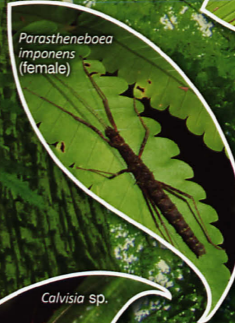
Parastheneboea imponens (female)