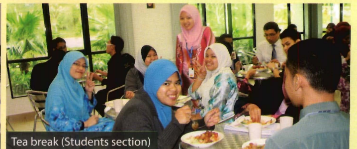
Tea break (Students section)