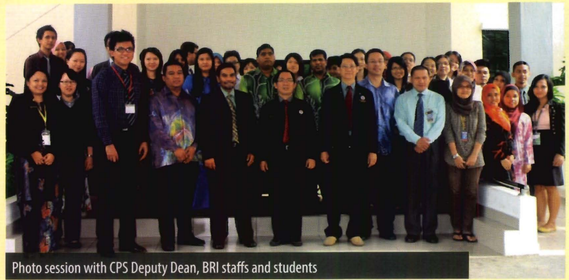
Photo session with CPS Deputy Dean, BRI staffs and students