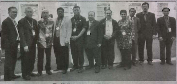
The UMS contingent with their prizes.