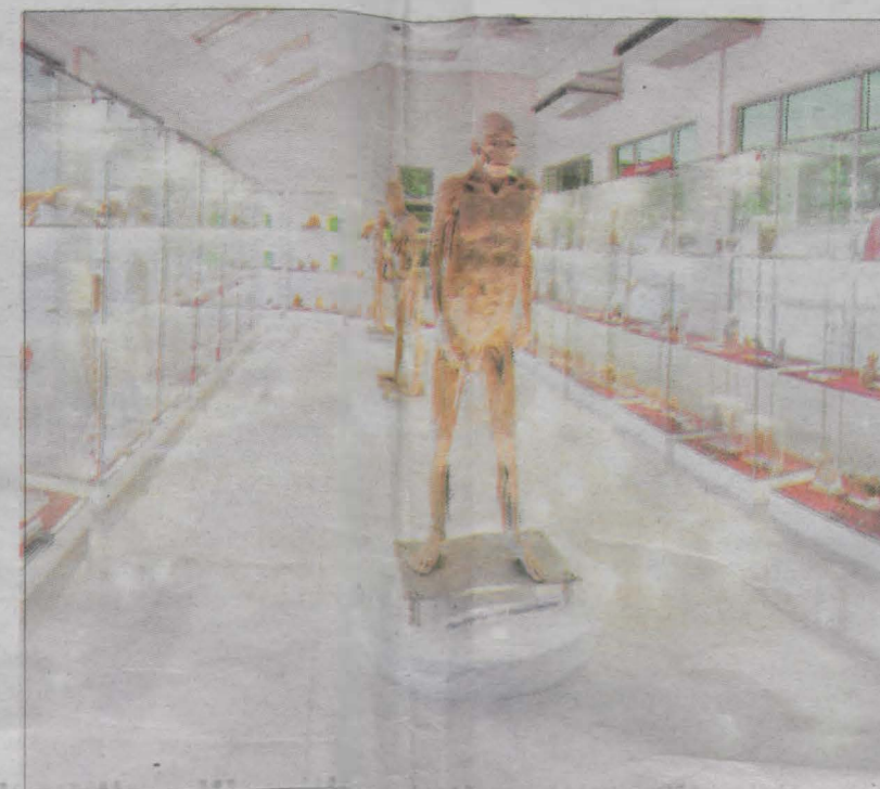
Ibnu Sina Medical Museum.