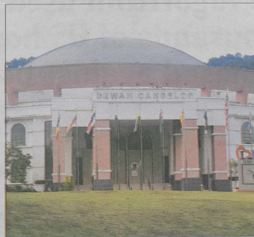
The Chancellor Hall.

"The UMS clock tower was initiated by Dr Mohd Harun and the location of the clock tower is interesting because it is erected right in the middle of the straight line from the Chancellery Twin Tower to the main road.