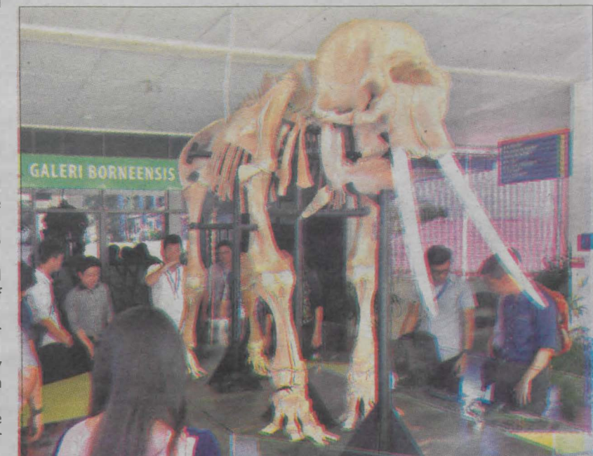
Skeleton of a Borneo pygmy elephant at Borneensis Gallery.

footprint inside the campus and to ensure easy accessibility for tourists and visitors.