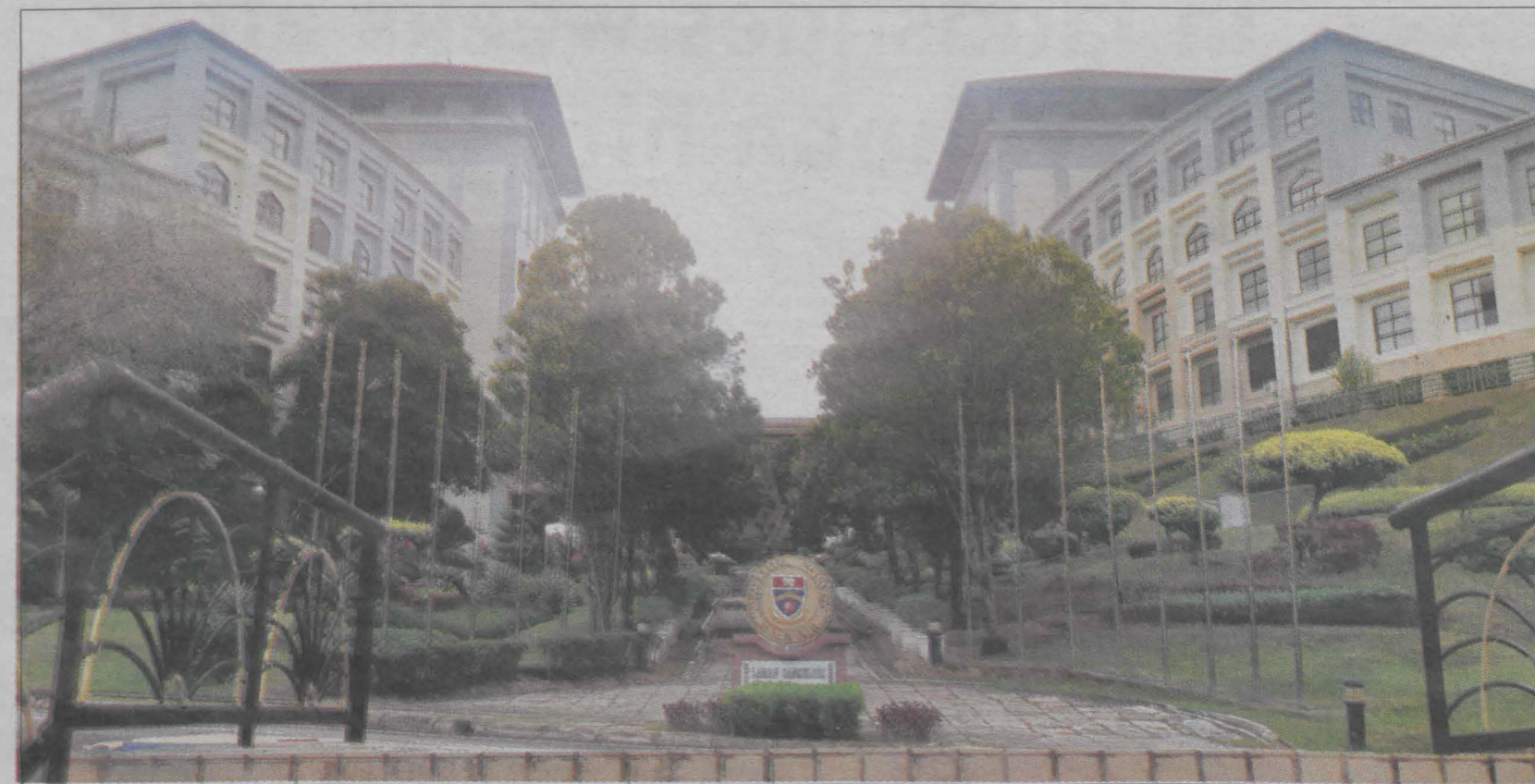
The Chancellery Building also known as the Twin Tower.