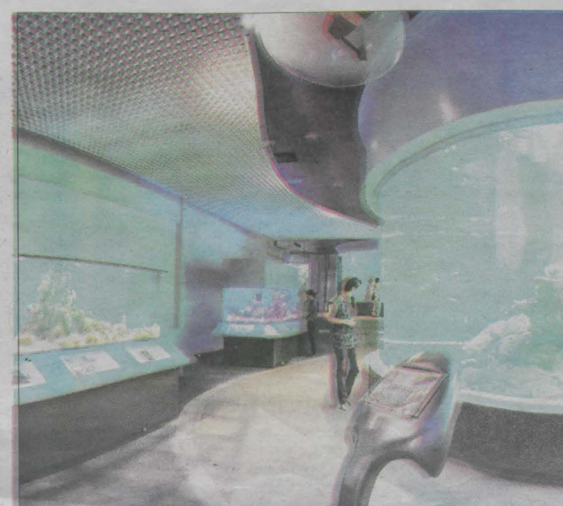
UMS Aquarium and Marine Museum.