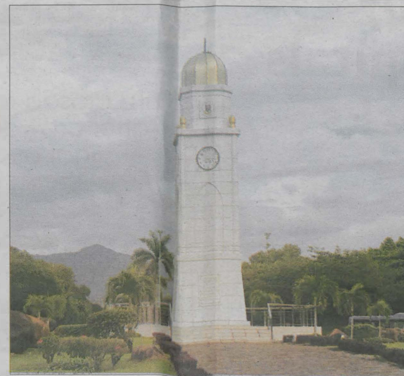
UMS clock tower.